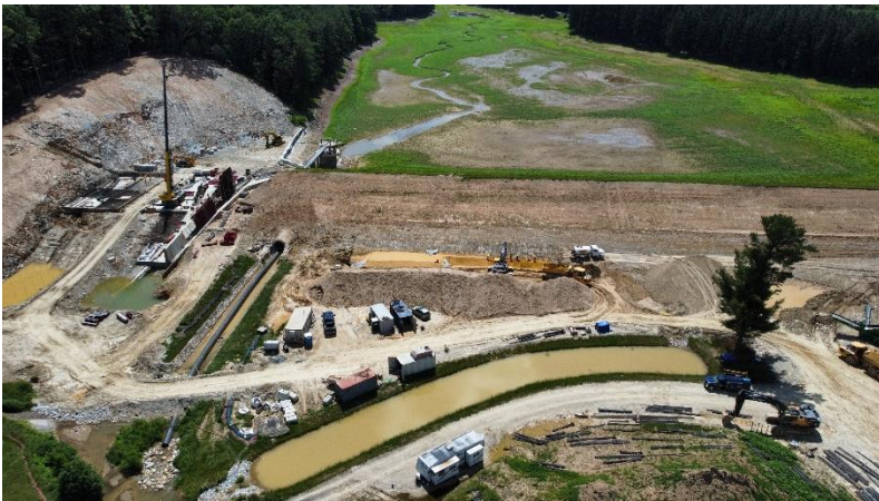
Sheppard-Myers Dam – Ariel View #2 (June 2022)