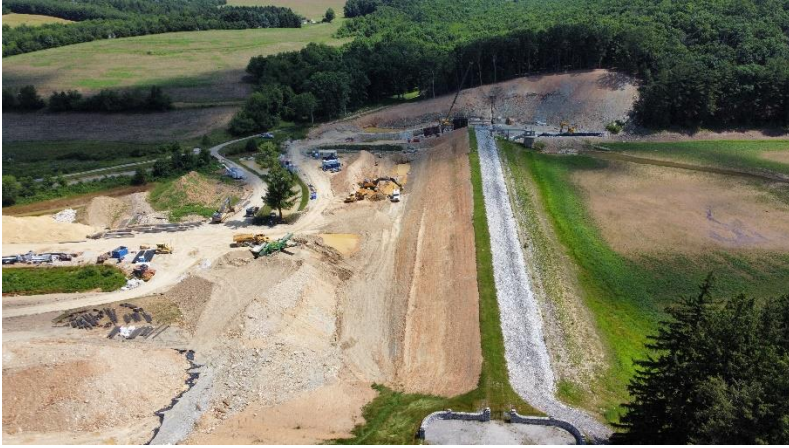
Sheppard-Myers Dam – Ariel View #1 (June 2022)